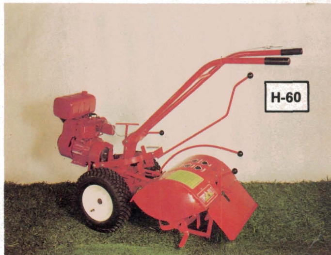
6 HORSE POWER RECOIL STARTING (Cast Iron Tecumseh-Lauson Engine)

The basic HORSE Model Troy-Bilt for light or medium duty use. Equipped with Bolo Tines and diamond tread tires. Please see next page for details of other tines and tires. 260 lbs.