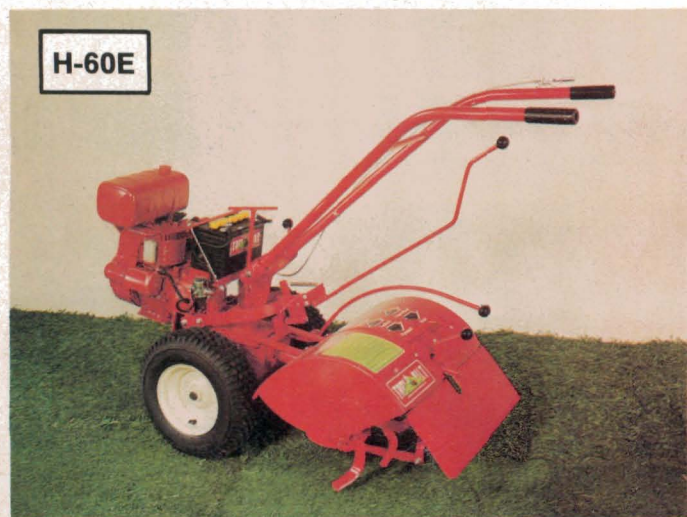
6 HORSE POWER ELECTRIC STARTING (Cast Iron Tecumseh-Lauson Engine)

By far the most popular Troy-Bilt HORSE Model. Heavy Duty Engine, Bolo Tines, and diamond tread tires all standard. 268 lbs.