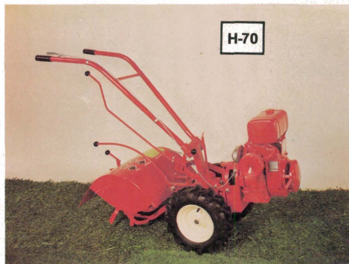
7 HORSE POWER KOHLER RECOIL STARTING Professional Model

Equipped with starter motor and 12 Volt battery (30 amperes, 54 plates). Battery automatically recharges while you till. Starts easily in cold weather; can also be started by hand. All tiller and engine controls are at the operator position — a real convenience for many folks. Except for the electric start option, it's the same as the 6 Horsepower Model at right above. 294 lbs.