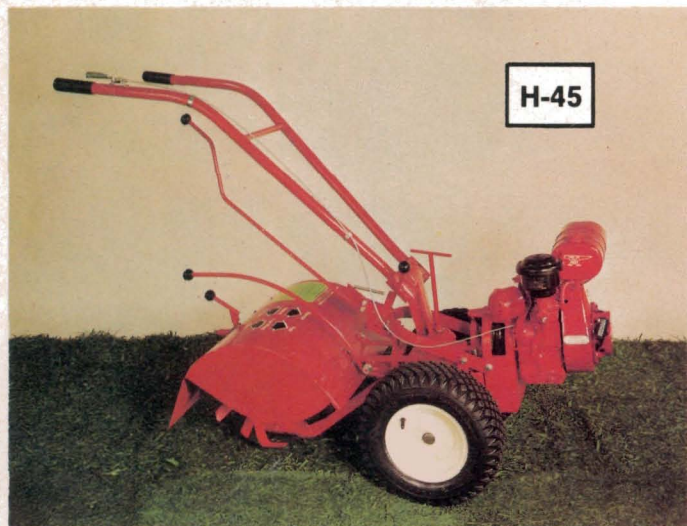
4½ HORSE POWER RECOIL STARTING (Cast Iron Clinton Engine)

The basic HORSE Model Troy-Bilt for light or medium duty use. Equipped with Bolo Tines and diamond tread tires. Please see next page for details of other tines and tires. 260 lbs.