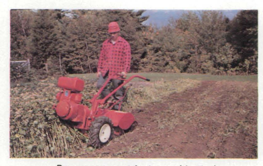
Power compost faster and better!

And, there are many, many more improvements . . . both seen and not seen . . . that make this newest Troy-Bilt the best machine we've ever produced.